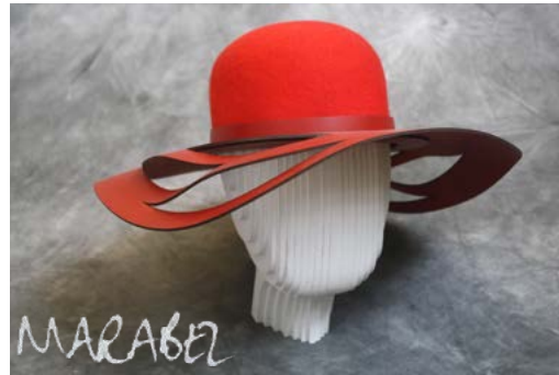
£375 Felt hat with wide leather brim draped with curve cuts