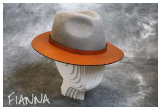
£295 Felt Trilby with flat leather brim and band