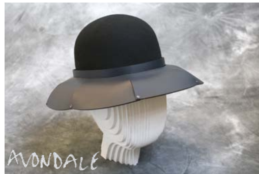
£370 Felt hat with a downturned leather brim formed through riveted darts