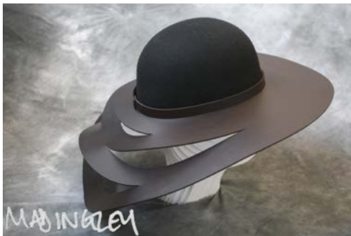
£375 Felt hat with wide leather brim, draped at the back