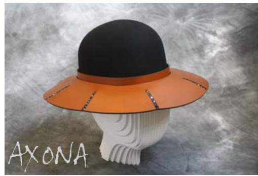
£525 Felt hat with a downturned leather brim formed through seams of hand sewn Swarovski crystals