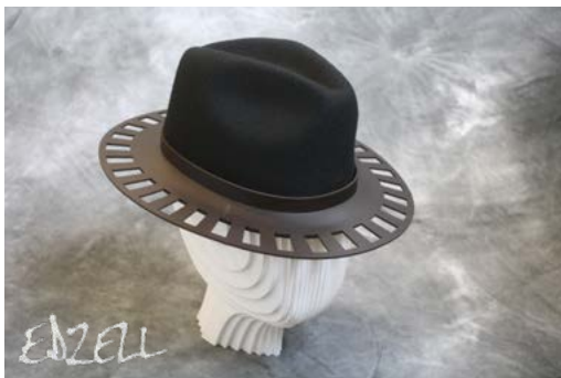
£330 Felt Trilby with geometric cut out leather brim