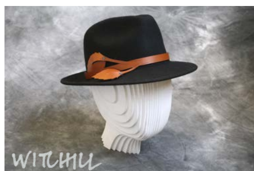
£235 Felt Trilby with two leaf leather band