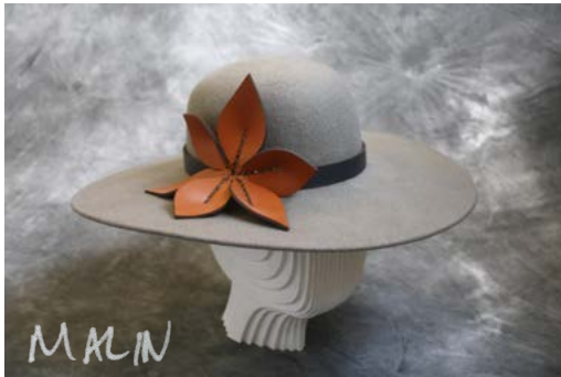
£450 Wide brimmed felt hat with leather band and large leather flower with hand inlaid Swarovski crystals