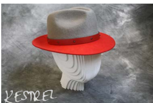
£295 Two tone felt Trilby with leather band hand inlaid with Swarovski crystals