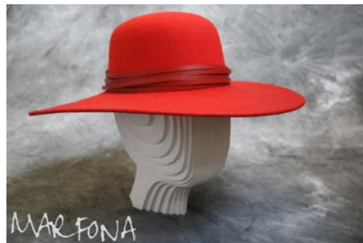
£325 Wide brimmed felt hat with five interwoven leather straps