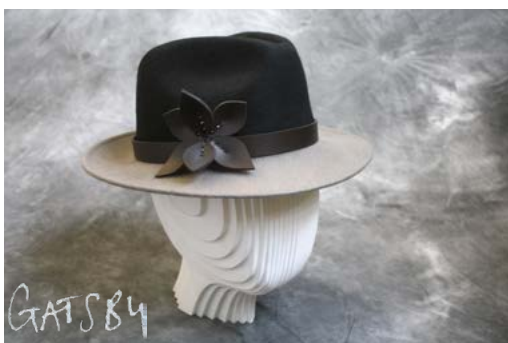
£320 Two tone felt Trilby with leather band and small leather flower with inset Swarovski crystals